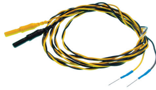
Disposable Subdermal Needle Electrodes, Twisted Pair