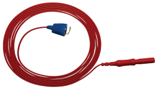
Disposable Corkscrew Needle Electrodes

Our Disposable Stimulation Probes combine perfectly with our Disposable Subdermal Needle Electrodes or Disposable Adhesive Surface Electrodes when monitoring the patient's nervous system during surgery. Our portfolio contains a wide range of options for every procedure, including several different lead wire lengths and colors.